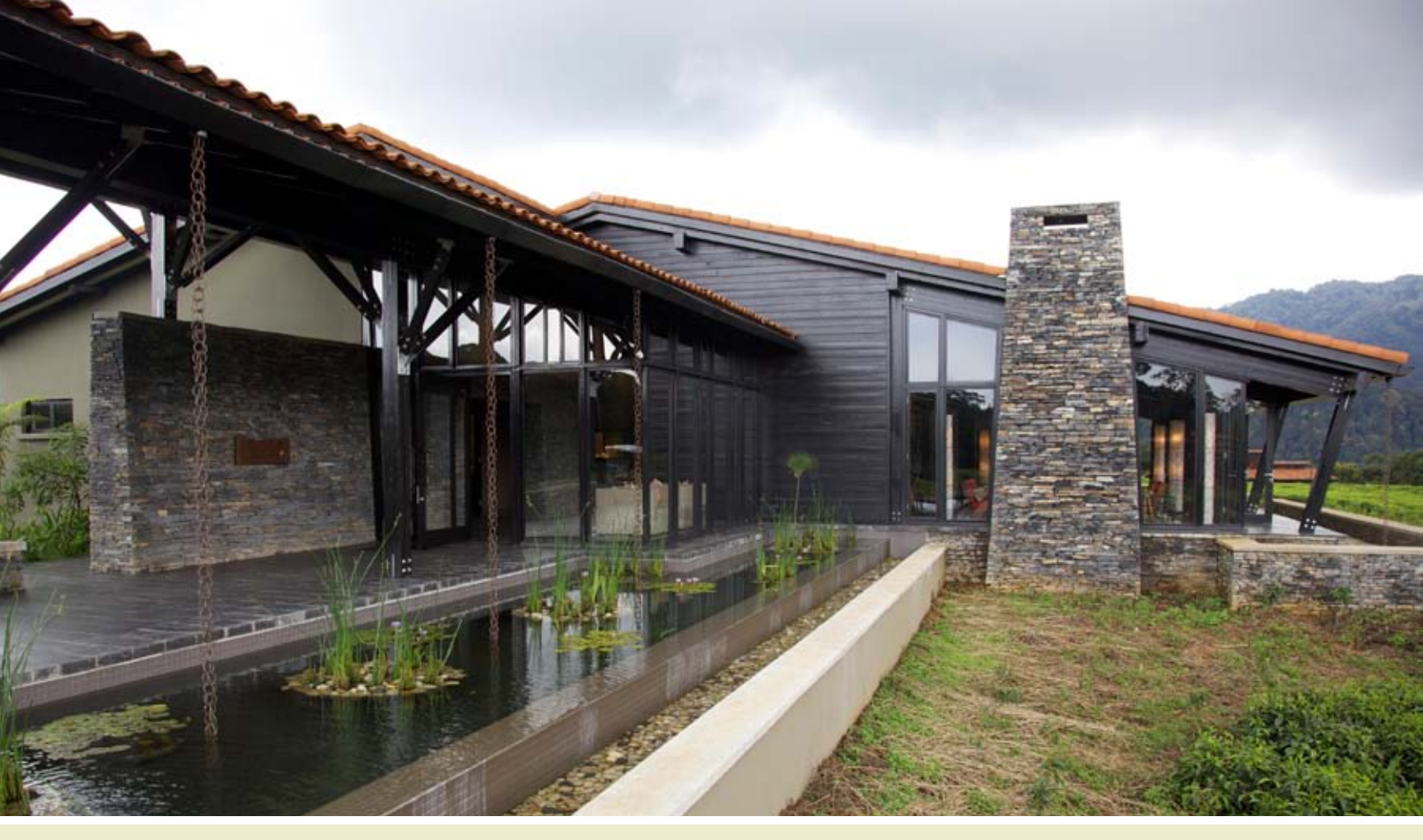
Above: A modern silhouette sets Nyungwe apart from typical lodges. Below: Natural materials abound in the cozy dining room. Opposite page, from top: Tufted leather chairs and paper pendant lamps in the function room; infinity poolside dining.