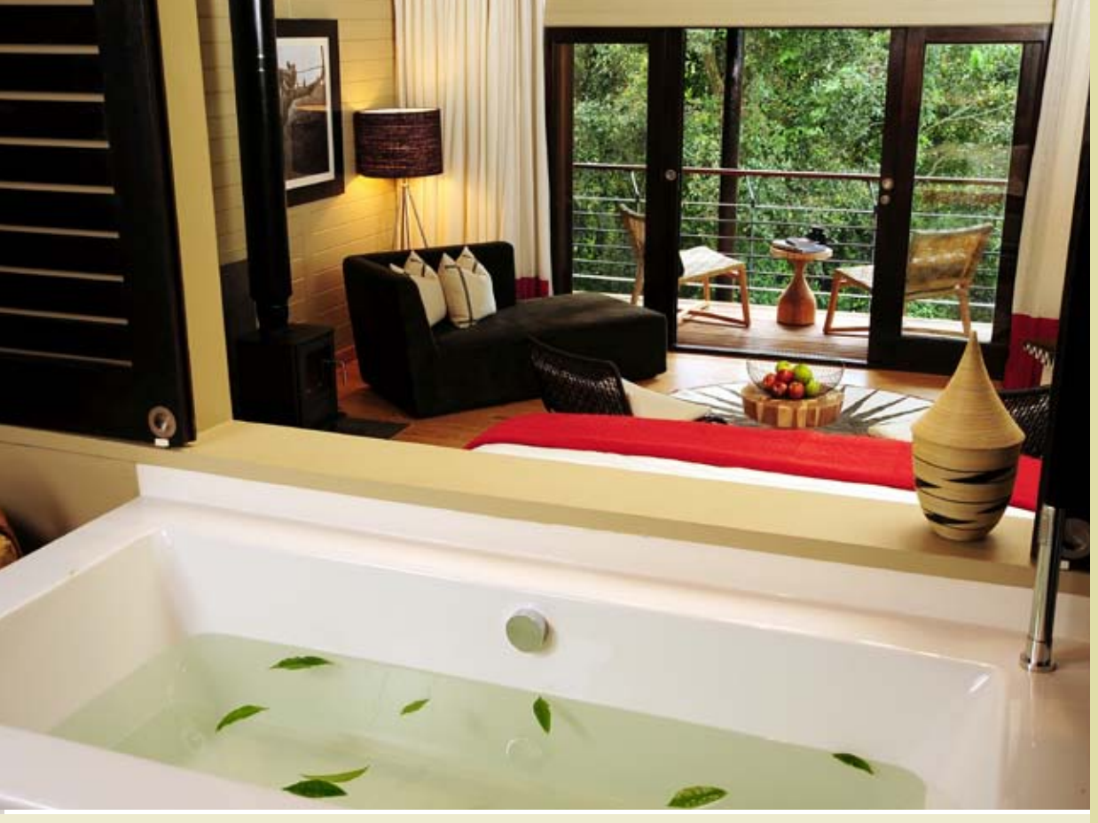
Above and opposite page: In Guest Villas, guests can bathe, sleep, or entertain with nonstop views of the surrounding rainforest. Below: Objects like this tree-trunk table are an elegant way to bring the outdoors in.