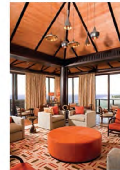
The Coral Tree (far left) serves bistro-style fare, including Durban curries, while the buffet area offers an extensive array of breakfast and lunch options. 31 Degrees (left) is a vibrant cocktail bar just off the main lobby. Wine connoisseurs can enjoy a wide selection of local wines plus tapas-style bar food at Vinum (below).