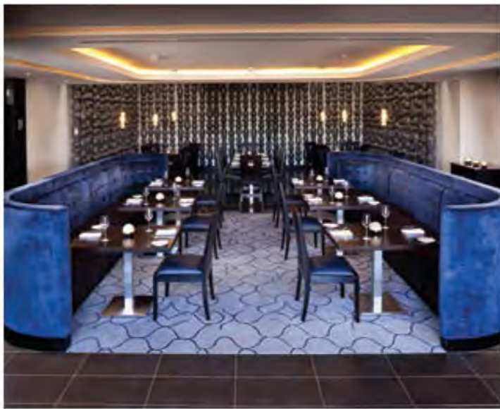
Osa (left) is a sophisticated steakhouse. The 18-hole golf course at the Zimbali Country Club (below) is surrounded by coastal forest that's rich in bird and animal life. Guest rooms (opposite) are elegantly furnished and come with every modern convenience.

you can walk across the sand, splash your toes in the waves and keep a watch out for any dolphins. (If you do want a dip in the ocean, simply book a transfer to nearby Westbrook or Salmon Bay with reception.)