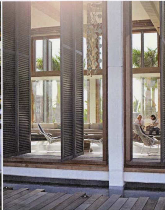
GLAM IT UP CLOCKWISE FROM ABOVE: The chef at Chopsticks whips up delicious contemporary Chinese fare; the clean lines and dramatic vertical scale of the entrance sets the tone for the hotel's sophisticated urban design; the Shores cocktail bar and lounge; the Piazza is the communal hub of the hotel OPPOSITE: Chill out on the pristine beach under an umbrella