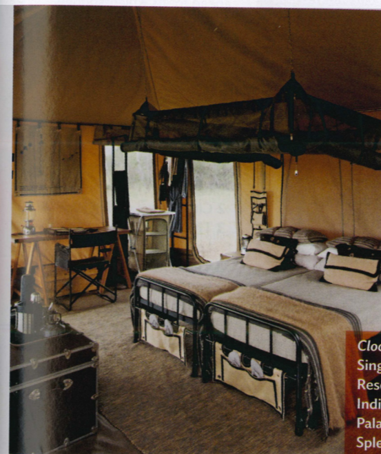
Clockwise from left: Singita Grumeti Reserves in Tanzania; India's Taj Falaknuma Palace; Hotel Splendido, Italy