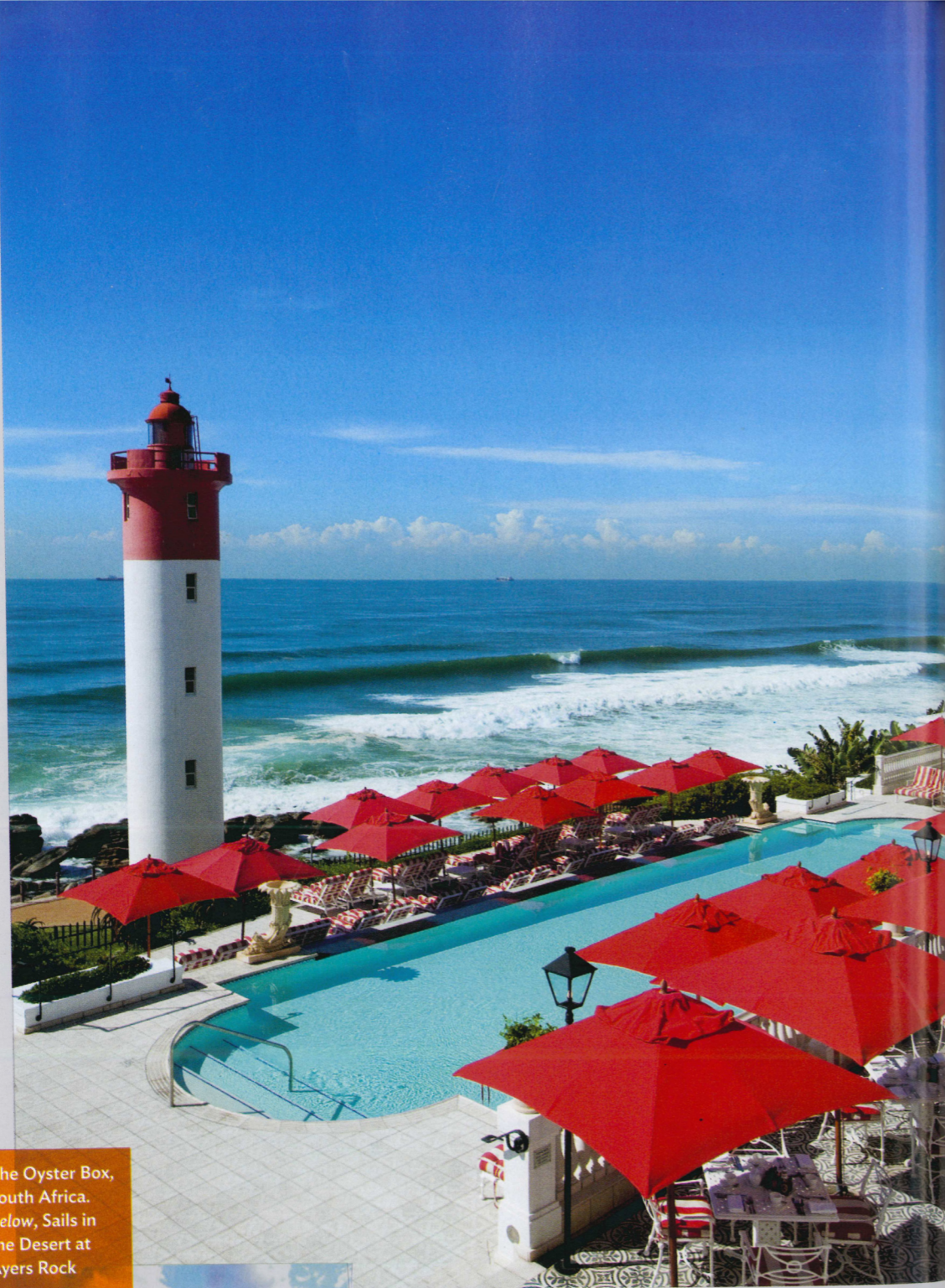
The Oyster Box, South Africa. Below, Sails in the Desert at Ayers Rock